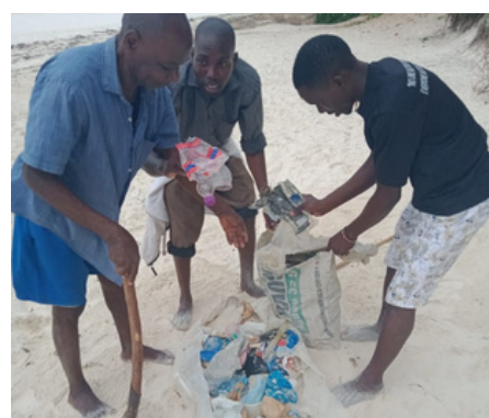
Top Left: Students on safari learning about wildlife from one of the rangers. Top Right: Some of the art pieces submitted into the Diani Sea Turtle Festival. Bottom Left: Students after a long hike while on safari. Bottom Right: The Valor to Virtue team out on their regular beach clean up.

We participated and sponsored the Diani Sea Turtle Festival in 2021. An annual conservation festival in June, with the sole purpose of increasing awareness of local sea turtle conservation. This event is free to all, and brings 200 students from the local area to join in on the festivities. Our donation went towards the running of the art competition. You can read more about the festival by going to https://ceskenya.org/wp-content/uploads/2021/07/DSTF-2021-Report-V2.pdf